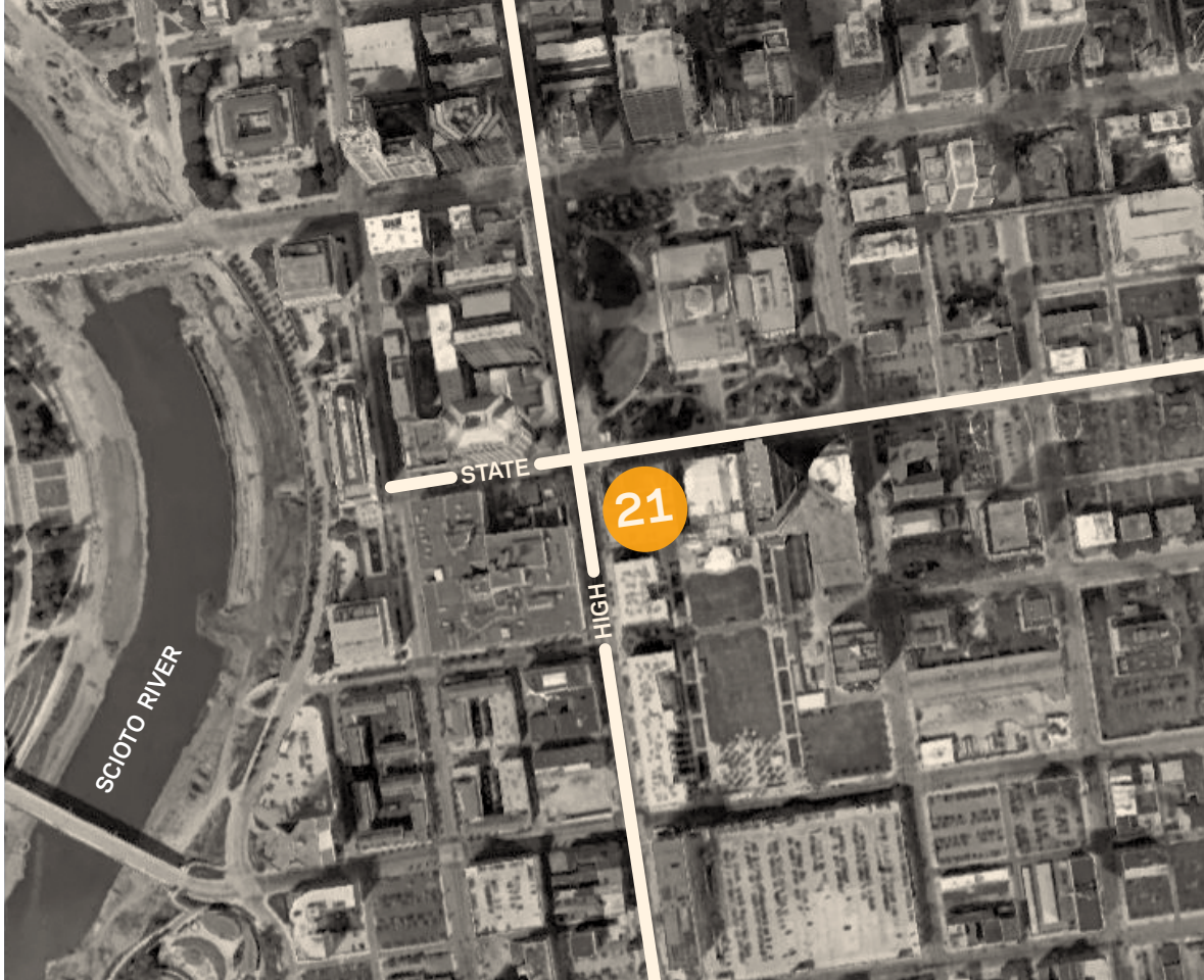
Positioned in the heart of downtown Columbus.